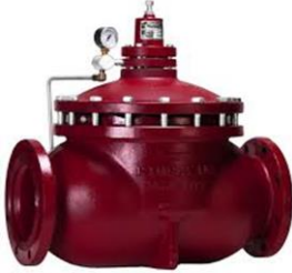
Kimray PRB Pressure Regulator Balanced