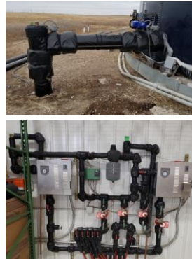
Freshwater Tank Radiant Floor Heat