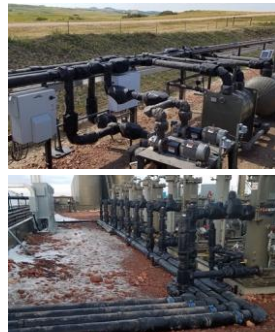
High Traffic Areas